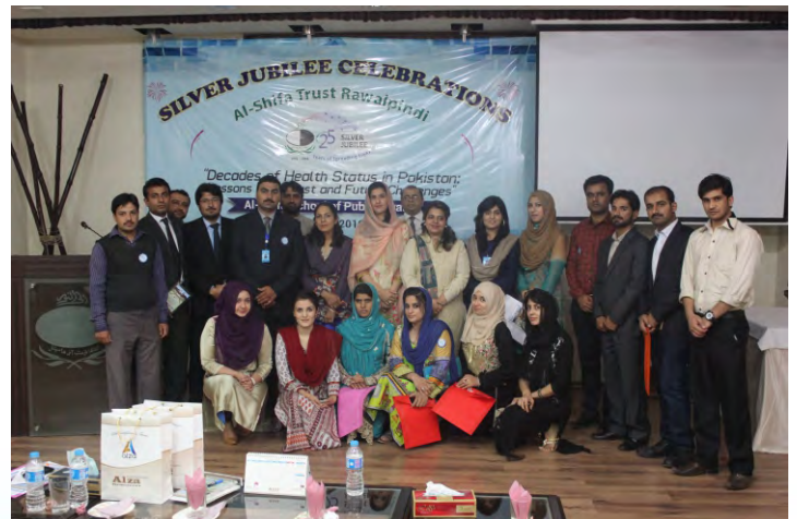
Al-Shifa School of Public Health

"Lets Fight Together Against Blindness with AL-SHIFA TRUST"