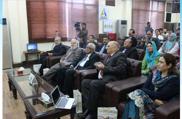
Ped Seminar attracted leading ophthalmologists