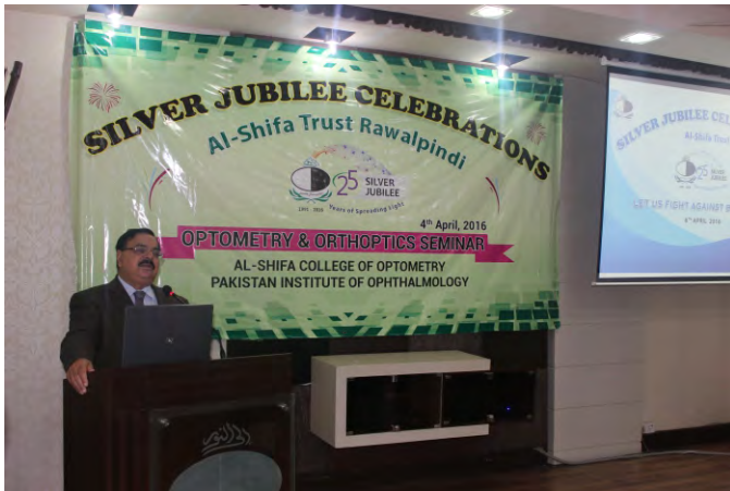
President AST at one of the Seminars