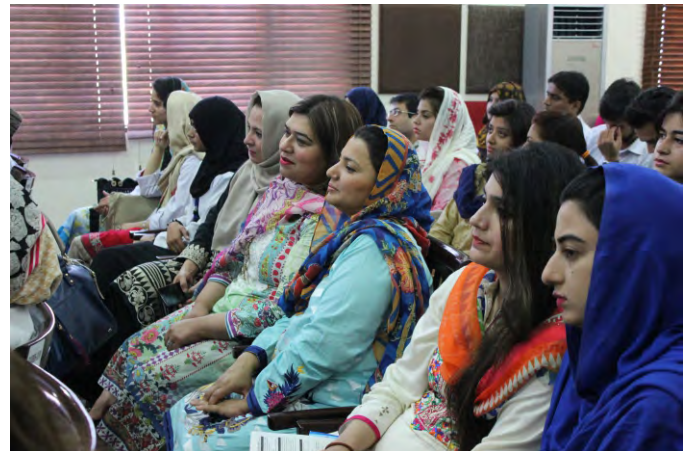
A view of Seminar