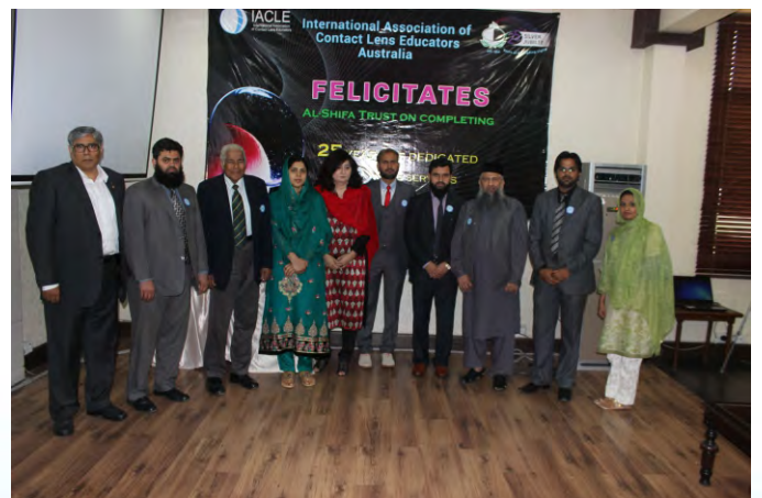
Speakers at Optometry Seminar

"Lets Fight Together Against Blindness with AL-SHIFA TRUST"