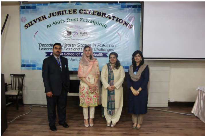
Smiling Organizers of Public Health Seminar